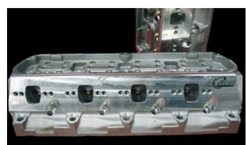
Sold COMPLETE & ready to use!