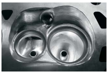
Valves positioned for maximum piston clearance

Our heads are matched to Fel-Pro 1262 intake and 1415 Exhaust gaskets allowing you to use your small-tube headers or turbo-manifolds that won't line up on the larger ports of the AFR or TFS heads that require a 1487 exhaust gasket. If you happen to use a large port design and need a 1487– no worries! The heads are easily opened up as the exhaust runner is larger than the outlet resulting in even greater flow!