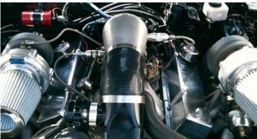
Fuel / Meth Tool combo